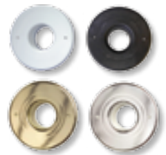
5" outer diameter plastic outlet for ceiling applications (available in white, black, brass, chrome or custom paint finishes)

A huge selection in outlet choices is available. Our outlets come round or slotted, and are designed to fit any decor or home architecture without compromise.