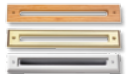
Slotted outlet for sidewall applications (available in a variety of finishes and wood species)